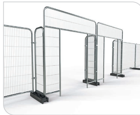
Double Gate Set Up