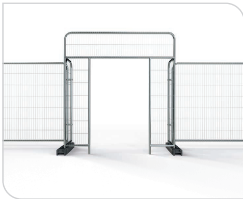
Clear and Visible Entrance

For high-traffic areas, two gates can be linked together to increase flow and create separate entry and exit points. The Gantry Entrance Panel is a flexible, reliable solution for managing pedestrian access.